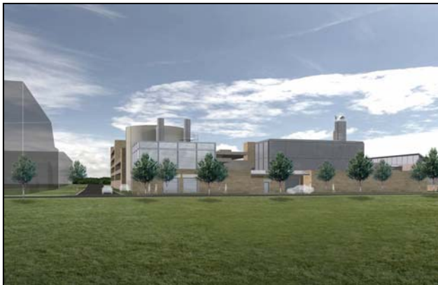
*Rendering Courtesy of Karlsberger

The DCMCCT packaged hybrid CHP energy plant will be the first commercial in-site energy plant project to be owned and operated by Austin Energy. The packaged plant concept used for the DCMCCT hybrid energy plant is the result of lessons learned from the Department of Energy CHP Development Project located at the Domain Technology Business Park located in Austin. The DCMCCT hybrid energy plant will expand the concept beyond a packaged CHP plant to include all of the necessary components to provide all of the power and thermal requirements of the hospital. Burns & McDonnell was selected as the packaged plant equipment supplier and system integrator by Austin Energy as result of an extensive competitive selection process.